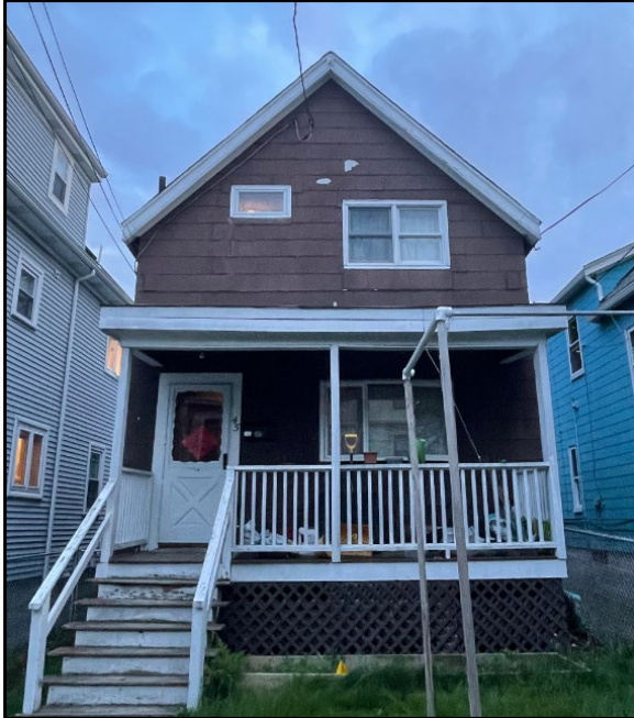
Right: Left Elevation