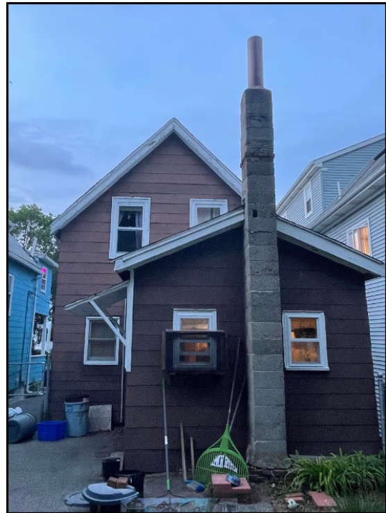
Right: Right Elevation